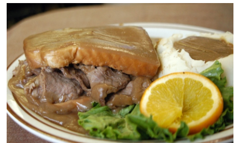
Hot Roast Beef

Served with homemade gravy and "real" mashed potatoes