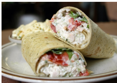
Chicken Salad Wrap

Grilled shaved steak with peppers, onions, mushrooms and mozzarella cheese