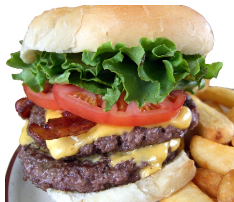
Double Whami Burger

6 oz. lean ground beef pattie, topped with Canadian bacon, served on a hard roll with lettuce, tomato, mayo and French Fries..... 10.49 With cheese..... 10.99